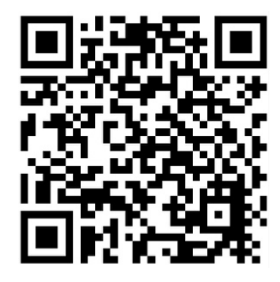
Traffic Map